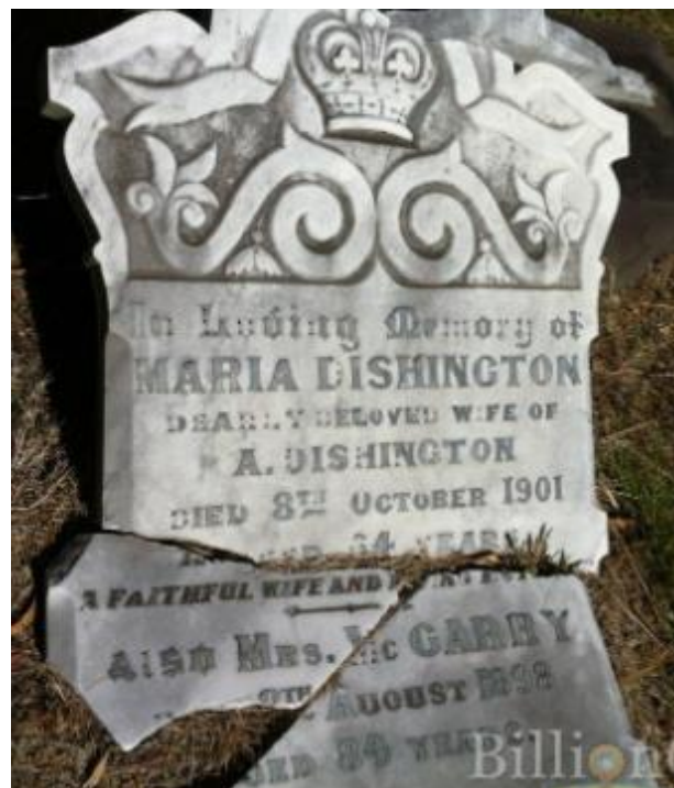
Headstone at St Helens General Cemetery